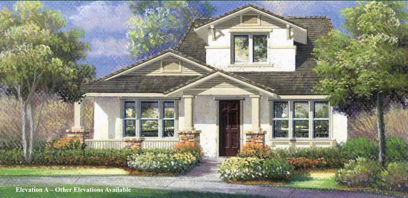
Elevation A – Other Elevations Available